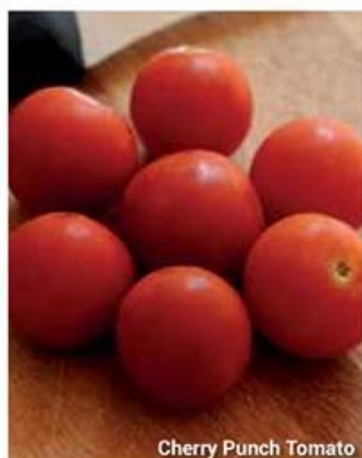
Cherry Punch Tomato