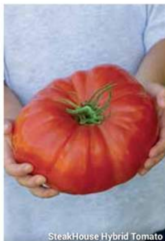
SteakHouse Hybrid Tomato