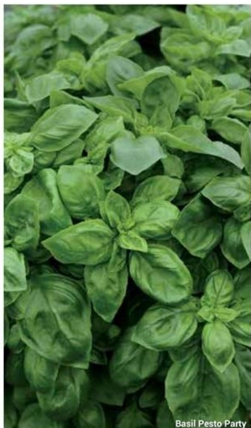
Basil Pesto Party