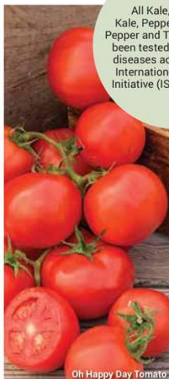
Oh Happy Day Tomato

All Kale, Flowering Kale, Pepper, Ornamental Pepper and Tomato seed has been tested for seedborne diseases according to the International Seed Health Initiative (ISHI) guidelines.