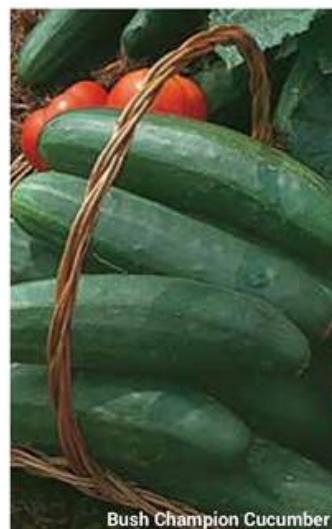
Bush Champion Cucumber