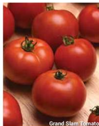
Grand Slam Tomato