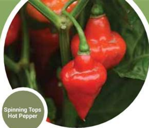
Spinning Tops Hot Pepper