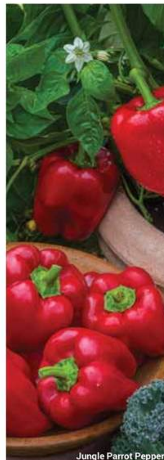
Jungle Parrot Pepper