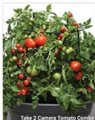
Take 2 Camera Tomato Combo