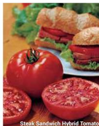
Steak Sandwich Hybrid Tomato