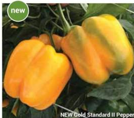
NEW Gold Standard II Pepper