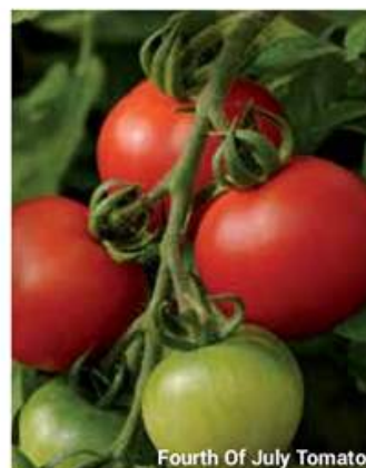
Fourth Of July Tomato