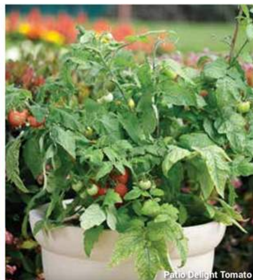
Patio Delight Tomato