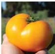
Lemon Boy Plus F 1 Slicer Tomato