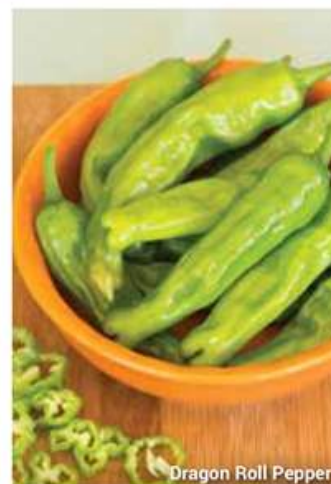
Dragon Roll Pepper