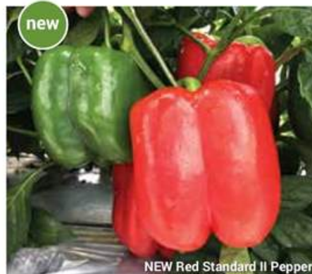
NEW Red Standard II Pepper