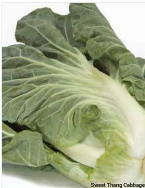
Sweet Thang Cabbage