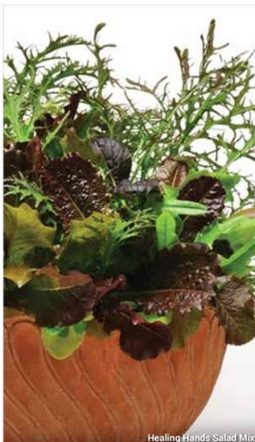
Healing Hands Salad Mix