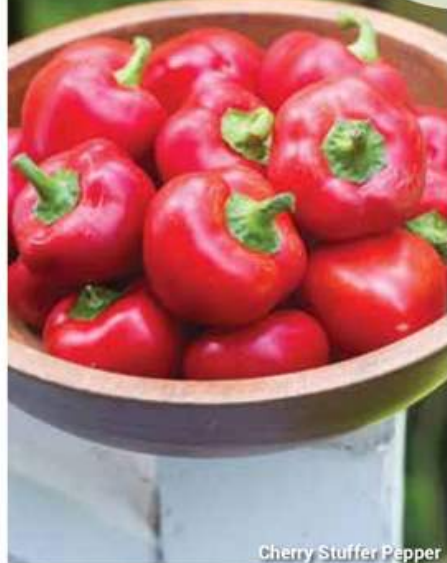
Cherry Stuffer Pepper

All Kale, Flowering Kale, Pepper, Ornamental Pepper and Tomato seed has been tested for seedborne diseases according to the International Seed Health Initiative (ISHI) guidelines.