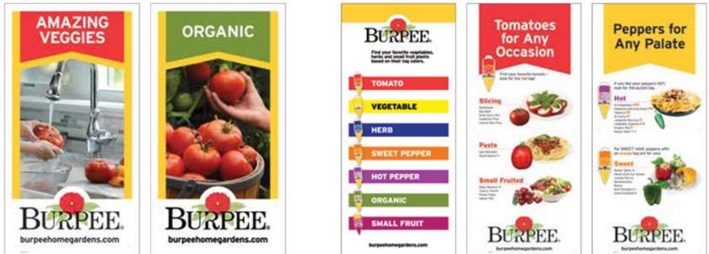
16 x 30-in. (240 x 76-cm) Signs