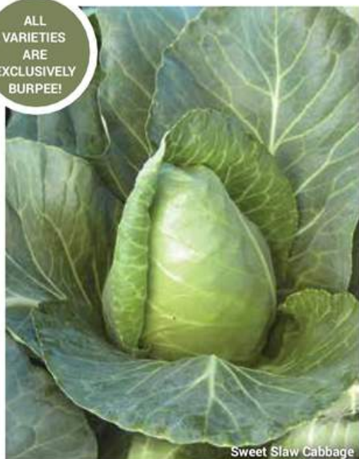
Sweet Slaw Cabbage