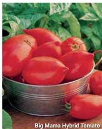
Big Mama Hybrid Tomato