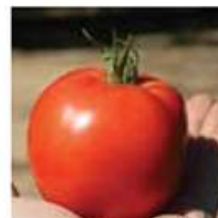
Big Beef Plus F 1 Beefsteak Tomato