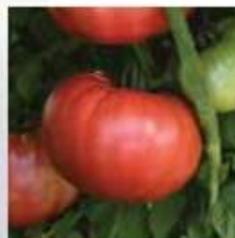
BlushingStar F 1 Beefsteak Tomato