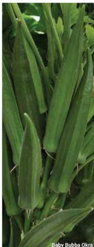
Baby Bubba Okra