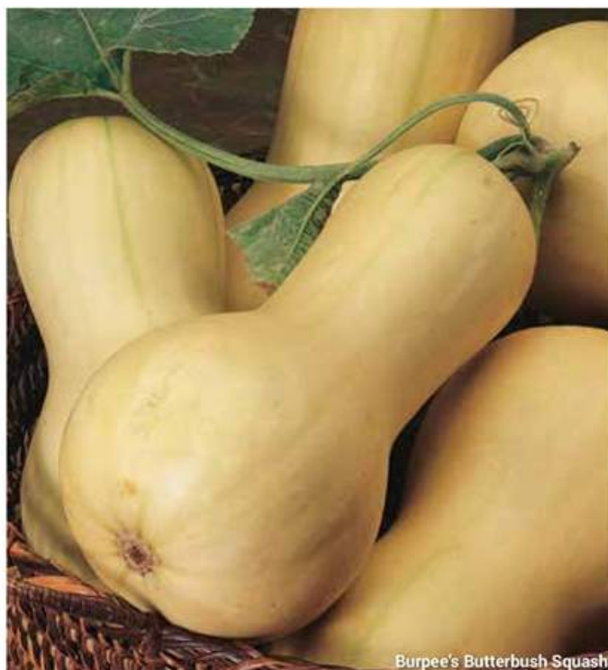
Burpee's Butterbush Squash