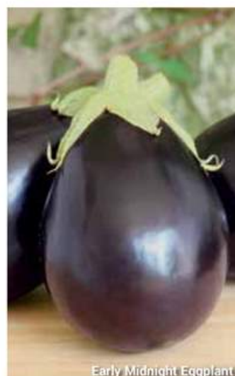
Early Midnight Eggplant