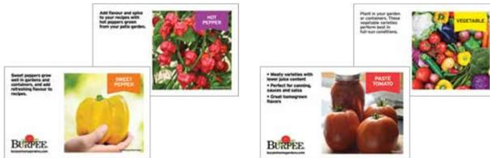
11 x 7-in. (28 x 18-cm) Benchcards