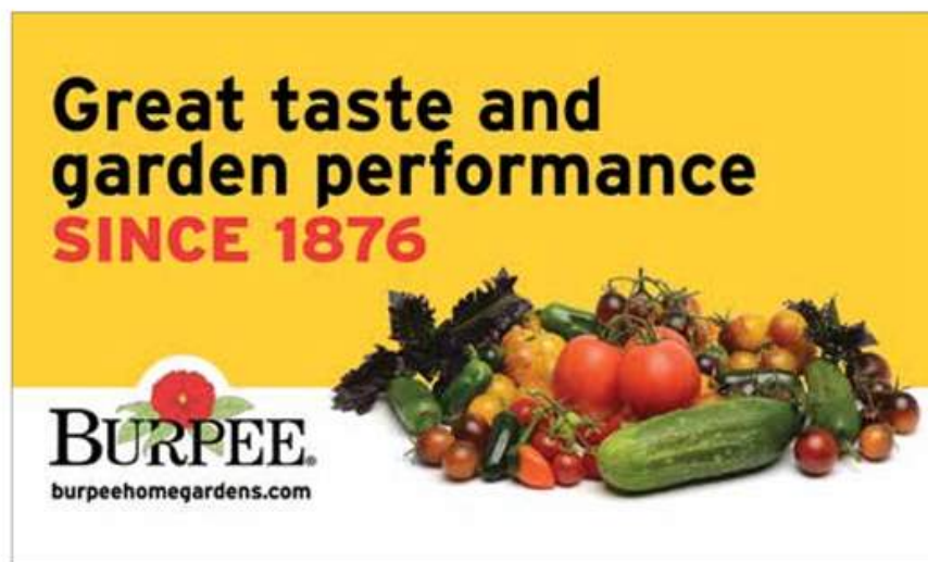
60 x 36-in. (152 x 91-cm) Fence Banner