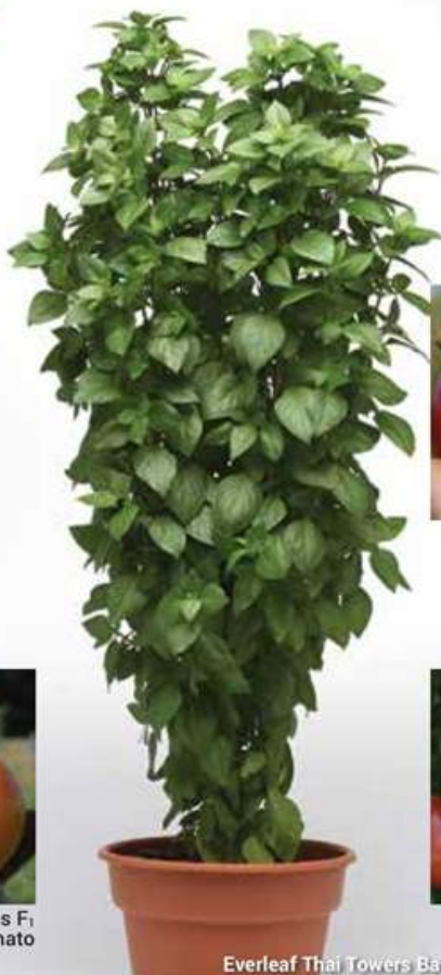
Everleaf Thai Towers Basil

These buzzworthy products are always top sellers.