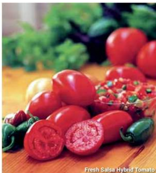
Fresh Salsa Hybrid Tomato