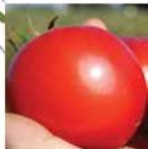
Early Girl Plus F 1 Beefsteak Tomato