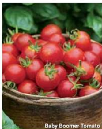
Baby Boomer Tomato