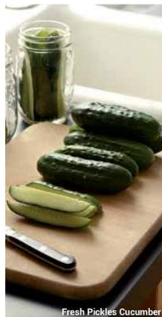
Fresh Pickles Cucumber

Vegetable seed is for bedding plant production only, not for commercial production use.