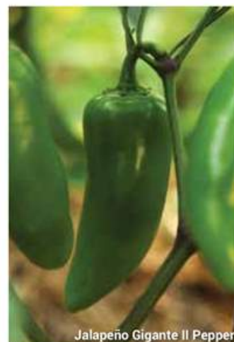
Jalapeño Gigante II Pepper