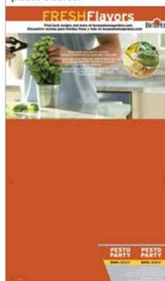
24 x 40-in. (61 x 102-cm) Sign

Appeal to shoppers with indoor herbs displayed in eye-catching plastic sleeves.