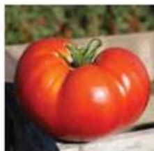
Better Boy Plus F 1 Slicer Tomato