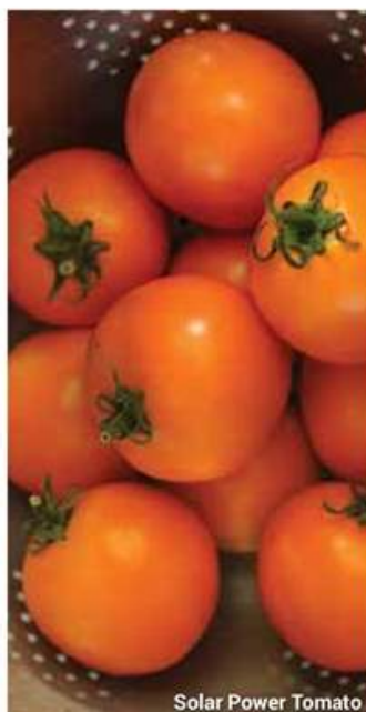
Solar Power Tomato