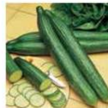
Telegraph Improved Slicing Cucumber