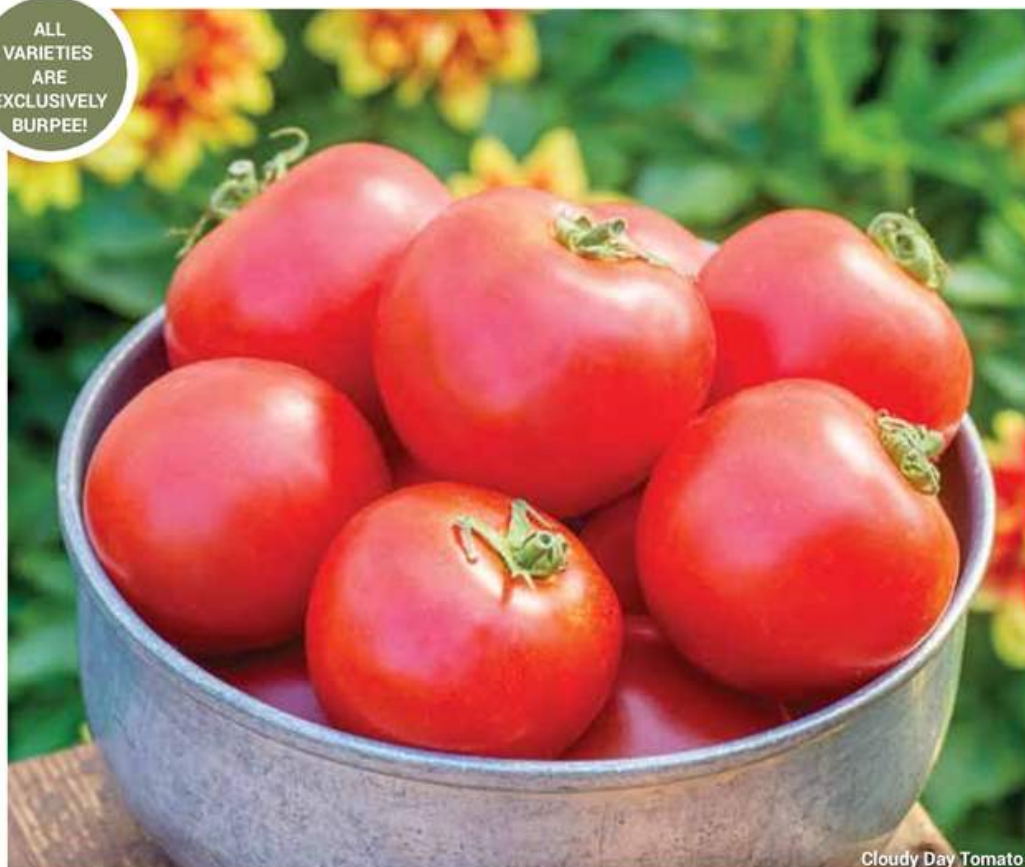
Cloudy Day Tomato