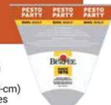
14 x 13-in. (36 x 33-cm) Clear plastic sleeves