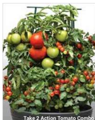
Take 2 Action Tomato Combo