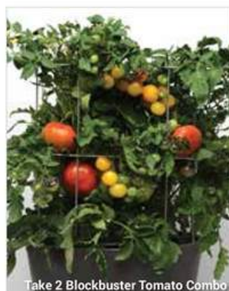
Take 2 Blockbuster Tomato Combo