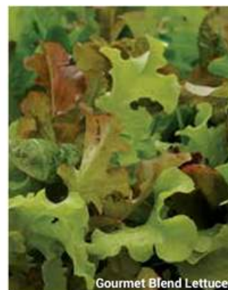
Gourmet Blend Lettuce