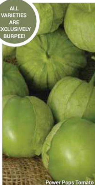
Power Pops Tomato