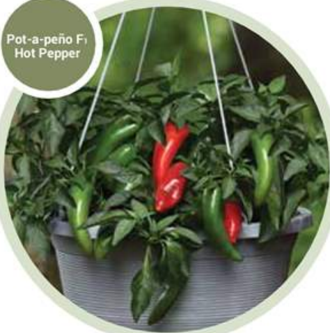
Pot-a-peño F 1 Hot Pepper

A known and trusted brand since 1876, Burpee® continues to bring the best in vegetables, herbs and flowers. Our quality plants are trialed across North America to ensure our varieties will grow well in any region. Among our best-tasting and top-performing vegetables, fruits and herbs, you'll find new and unique varieties for foodies, new edibles for hanging baskets and small spaces, and disease-resistant varieties that can stand up to tough conditions and keep producing large harvests.